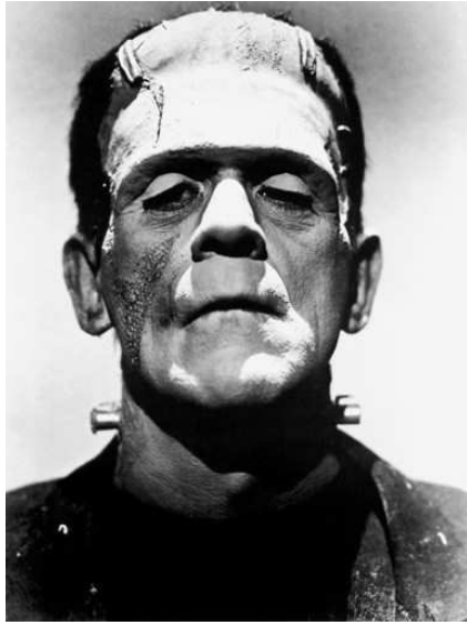
Fig. 1. Frankenstein's monster, Boris Karloff, 1931 [3]

his appearance which led him to fear and hide from them. The creature learns to speak and read and when seeing his reflection in a pool realised his physical appearance was hideous and it terrified him as it terrifies normal humans. The creature demands that Dr. Frankenstein creates a female companion like himself and whilst doing so he suffers fears that the two creatures may lead to the breeding of a race that could plague mankind and so destroys the unfinished female creature. In the end Victor dies and the creature drifts away on an ice raft never to be seen again. Shelley travelled through Europe in 1814 and along the Rhine in Germany with a stop at Gernsheim which is 17 km away from the Frankenstein Castle at Pfungstadt, where an alchemist and theologian, Johann Conrad Dippel, was born on 10 August 1673 and was engaged there in experiments on alchemy and anatomy performing gruesome experiments with cadavers in which he attempted to transfer the soul of one cadaver into another. He created an animal oil known as Dippel's Oil which was supposed to be an Elixir of Life . Soul-transfer with cadavers was a common experiment among alchemists at the time and Dippel supported this theory in his writings [5]. It is rumoured that he dug up bodies and performed medical experiments on them at Frankenstein Castle and that a local cleric warned the parish that Dippel had created a monster that was brought to life by a bolt of lightning.