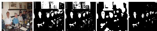
Fig 2. Performance analysis of image 6: (left to right) original images, outputs of [10], [11], [12] and of our method respectively. Shown are some examples from our WWW database that appear in Table 2.

colour space where we believe human skin clusters can be well classified with carefully selected boundaries. We provide some examples drawn from our experiments and results which are promising (see Fig 2 and Table 2). Additionally, we have set in context and proved that our proposition is deemed true as the set of results agrees reasonably with our speculated hypothesis that says: “Unlike the common thought, luminance inclusion does increase separability of skin and non-skin clusters” [9].