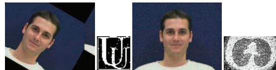
Fig. 1. Resistance to image processing attacks.

To cope with rotation, it is sufficient to locate face features, i.e., eyes, based on the method described in [21]. Salient features form reference points that dictate the orientation of embedding and thus aid recovery from rotational distortions. Fig. 1 (left) shows an attacked stego image with joint attacks of cropping, JPEG compression, translation (offset of 60 pixels) and rotation (-30 degrees) - shown with the extracted secret data and (right) attacked with salt and pepper noise - shown along with extracted secret data.