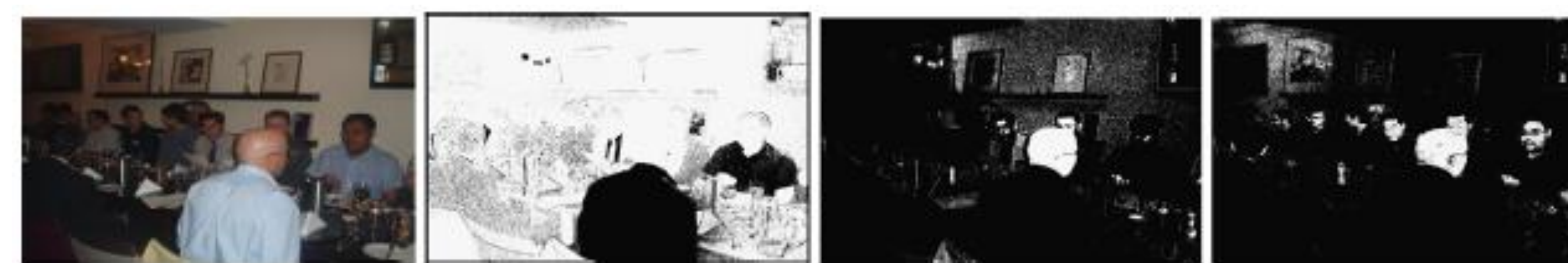
Figure 2: Skin detection in an arbitrary image: (left to right) original input image (image 8 in Table 1), skin tone detected by (Hsu et al., 2002), by (Berens et al., 2000) and by our method (far right)

The proposed algorithm outperforms both YC_bC_r and NRGB which have attracted many researchers to date. Figure 2 exemplifies how inherent properties of luminance can aid performance if handled intelligently. Notice how the proposed colour space is not affected by the colour distribution which enabled the system to detect skin tone with better efficiency.